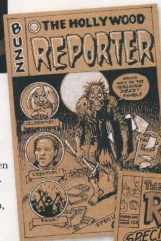
One of Stout's unused cover sketches, a takeoff on the EC Comics style of books such as Tales From the Crypt and Weird Fantasy .