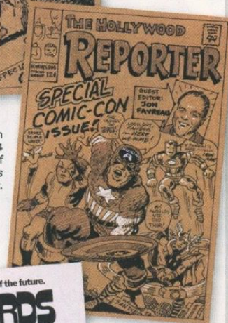
Stout's play on the March 1964 Silver Age cover of Marvel's Avengers #4, by Jack Kirby.