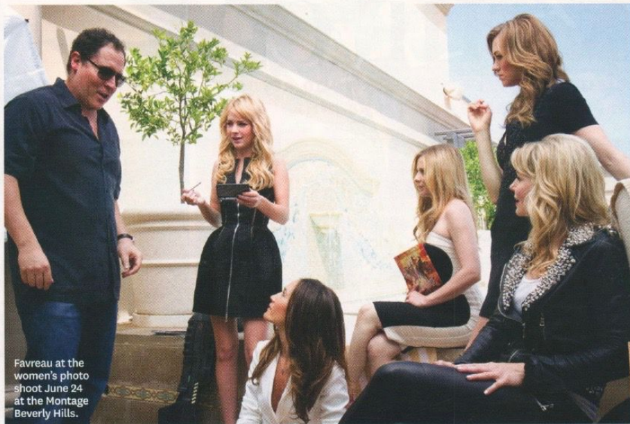
Favreau at the women's photo shoot June 24 at the Montage Beverly Hills.

W HEN I HEARD THAT THE HOLLYWOOD REPORTER WANTED ME TO BE the first guest editor for its special Comic-Con issue, it sounded like an interesting proposition. I've had a long journey at the Con, and San Diego has been an important place for me. I've learned a lot from the audiences there. It was fun to walk the floor as a fan, and now to be a voice in its identity is wonderfully gratifying. It's a group that is interested in what I was interested in when I was coming up, before I was even in the business, so I feel like I'm speaking to people I know.